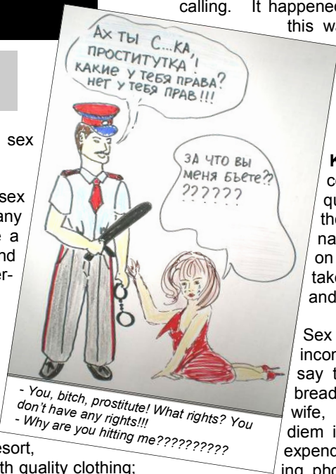
- You, bitch, prostitute! What rights? You don't have any rights!!! - Why are you hitting me????????????

Sex workers are a source of additional income for police. Usually sex workers say that we provide funds for buying bread, fuel, a birthday present for the wife, car repairs and renovations, per diem in case of travel, for covering the expenditures of renovating the office, paying phone bills, etc. Usually we pay the police a certain amount every week or month, so the policemen at the station not abuse you; but then policemen from any other station can come by. If you are working on the street, up to 10 policemen can come per