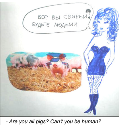
- Are you all pigs? Can't you be human?

Kyrgyzstan: Many sex workers do not turn to police at all, because their complaints will be rejected under pretext that they knew what to expect when they started sex work. The majority of sex workers who do report abusive clients, usually turn to a police officer they know: This police officer will catch the client, 'reappropriate' money, out of which a small amount returns to sex workers as a compensation for damages, while the larger sum stays with the officer. Usually, such operations and detentions are not taken to court.