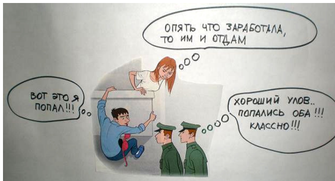
Girl: Again would have to give them everything I have earned. Clients: I am fucked!!!! Police: Good catch... Got both of them!!! Great!!!